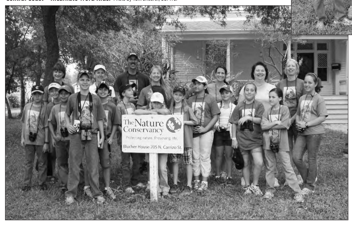
TOS Edinburg Kingfishers vs. Weslaco Kiwanis Fledglings.