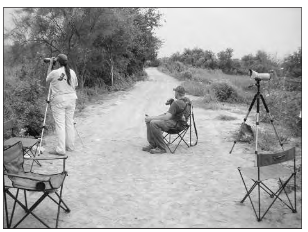
Southmost Sitters.

The Big Sit! Tournament continues to be a popular event. Teams came out in all sections of the coast identifying birds within their 17-foot circle. As part of the Big Sit! Tournament, the $3,000 Lone Star Bird Award was created. The Lone Star Bird Award is chosen by randomly drawing the name of a bird that can be seen along the entire Texas coast. Any Big Sit! team that sees this bird then goes into a drawing to determine the winner of the Lone Star Bird Award (this year's Lone Star Bird was the Least Sandpiper). This team then selects the habitat project to receive $3,000. The Big Sit! Tournament continues to grow so we made the decision to award two Lone Star Bird Award grants this year. Individual prizes are also given in this tournament category.