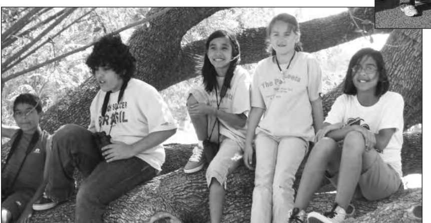
Weslaco Kiwanis Fledglings.