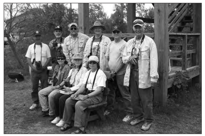
Brazosport Birders.