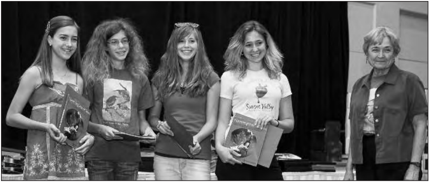
The Laughing Gals

Individual prizes: Peterson Field Guide to the Birds of North America donated by Houghton Mifflin and first-place framed 2009 Birding Classic artwork.