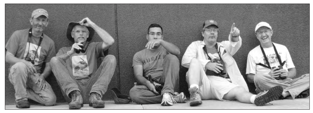
Weslaco Slice of Good Lifers

This was the second year we had a tournament with a little greener twist. The basic rules were that a team had to travel a minimum of 50 miles and turn in their mileage with their Official Checklist. Once the judges assessed the species list, we then calculated the number of species seen per mile driven. Both Gliders and Adult teams were eligible to compete in the coast wide Energy Saver tournament. A $3,000 Conservation Grant was awarded by the team with the highest number of species per mile. The teams that participated had a great time and enjoyed the challenge of determining a very birdy route.