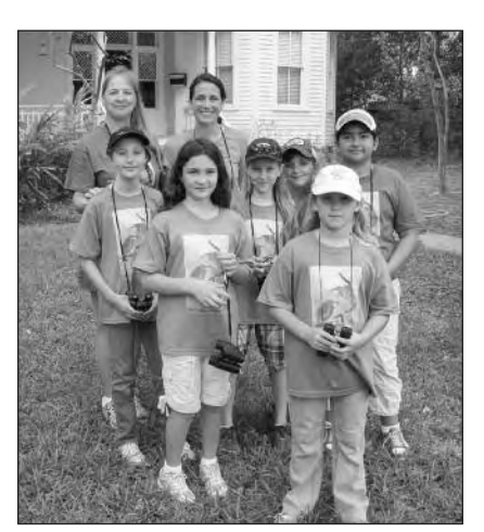
Cuckoo Cockatoos.

Chaperone: Robyn Cobb Number of species: 58