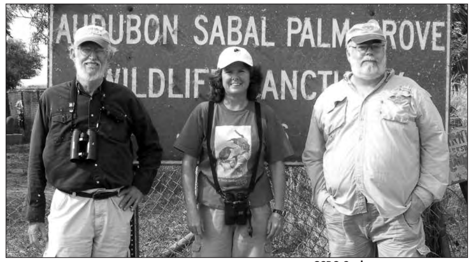
GCBO Cuckoos.