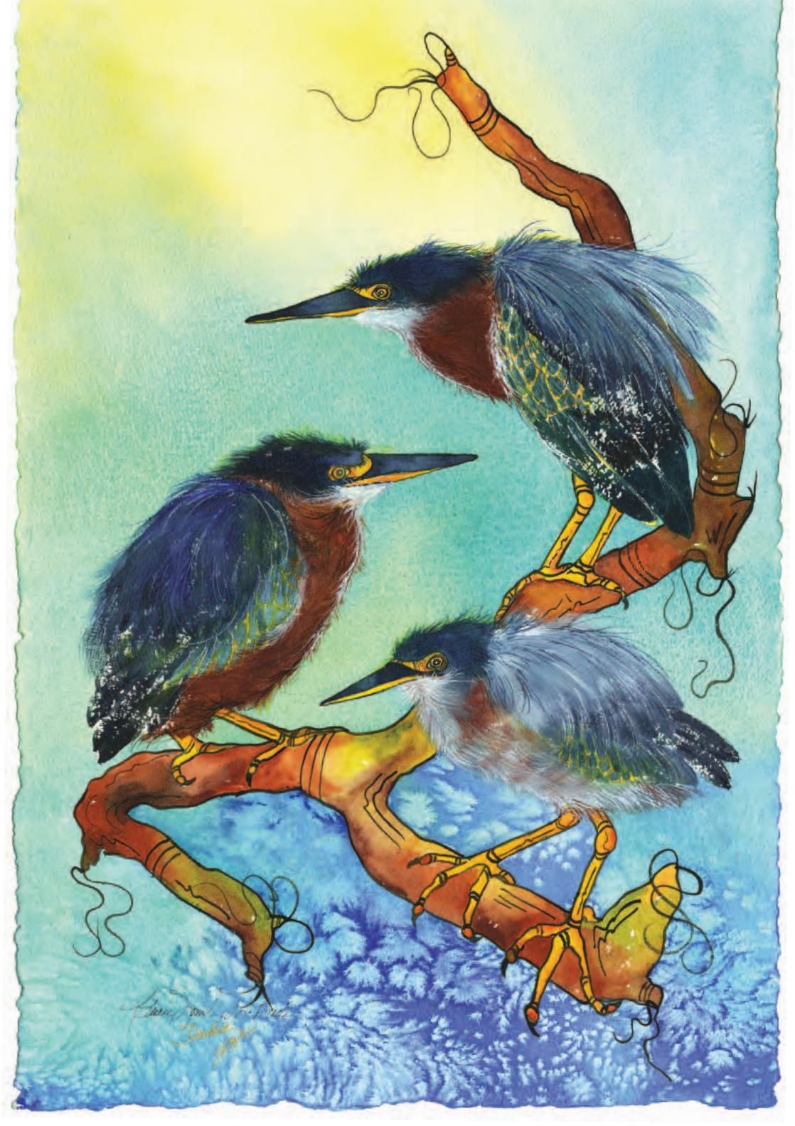
APRIL 26 - MAY 3