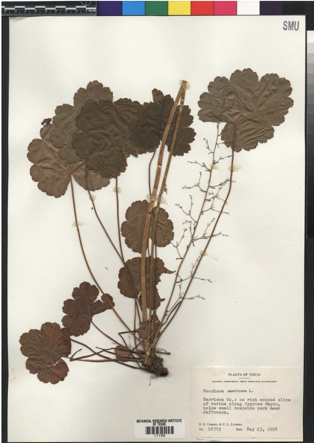
Figure 2. Correll & Lundell 18785 (SMU), from Harrison Co., Texas; the oldest Heuchera americana specimen from the state located during the study.