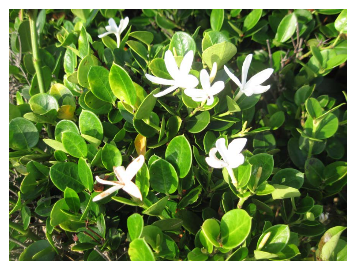
Fig. 2. Carissa macrocarpa (Natal plum) in flower.