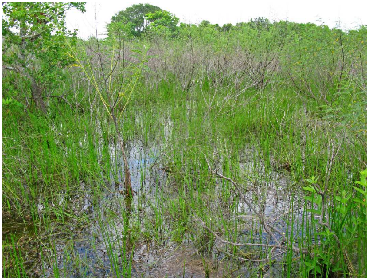
Figure 4. Freshwater depression pond at the type locality on the Falcon Point Ranch in Calhoun County.

Presently, Isoetes texana is known only from Aransas and Calhoun counties. It is limited to freshwater ponds and interdunal swales in neutral to moderately alkaline sands of Pleistocene and to Holocene barrier islands in the Gulf Coastal Bend of southern Texas. The vegetation is dominated by Rhynchospora spp., Fuirena spp., Eleocharis spp., and Cyperus spp. The dominant species include Fuirena scirpoidea , Fuirena longa , Rhynchospora microcarpa , and Rhynchospora divergens . Other characteristic and common species include Rhynchospora nitens , Cyperus oxylepis , Cyperus polystachyos var. texensis , Eleocharis geniculata (= Eleocharis caribaea ), Eleocharis flavescens , Eleocharis montevidensis , Eleocharis parvula , Xyris jupicai , Agalinis fasciculata , Bacopa monnieri , Buchnera americana (= Buchnera floridana ), Oldenlandia uniflora (= Hedyotis uniflora var. fasciculata ), Spiranthes vernalis , Drosera brevifolia , and Utricularia subulata . This plant community association occupies sandy depressions of variable hydrology. Some ponds draw down and desiccate in drier periods, but Isoetes texana seems restricted to those that hold water throughout the year (based upon limited observations). Structure varies with depth of water (or depth to water table) and frequency of inundation, and composition ranges from a sparse cover of tufted annuals to complete coverage by rhizomatous perennials.