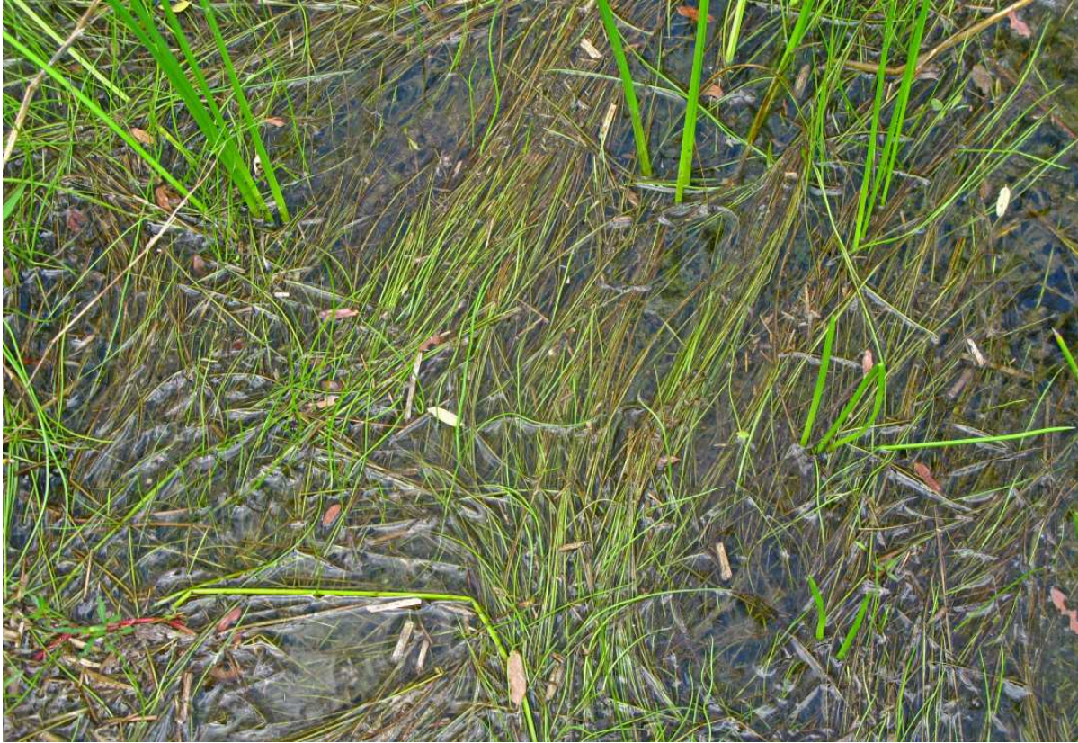
Figure 3. Isoetes texana at the type locality — the leaves are lying flat on water surface. Erect plants are Eleocharis montevidensis .

Isoetes texana is characterized by its aquatic habitat, long leaf length, megaspores of 350–405 \mu\text{m} with smooth surfaces (which may occasionally be obscurely rugulose), white color of microspore mass, and yellow-green leaf color (5GY 4/2-4, Munsell Color, undated).