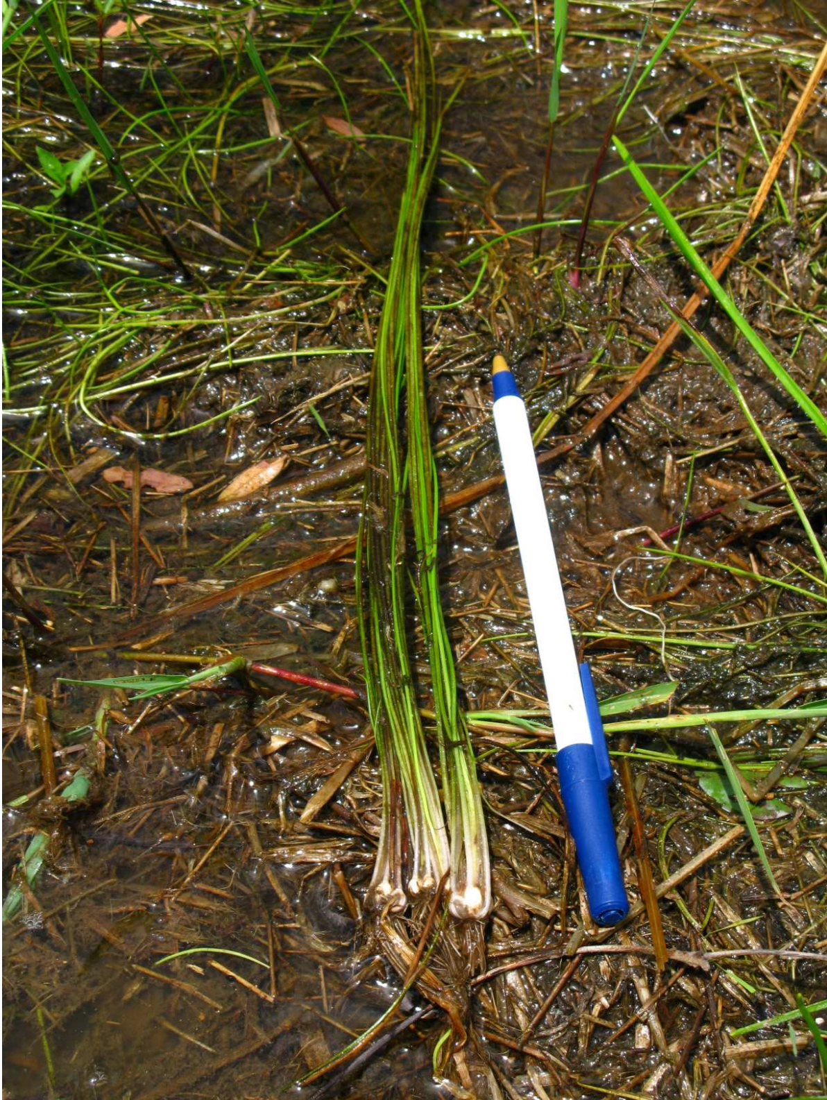
Figure 2. Isoetes texana (Singhurst 18336, holotype, BAYLU) immediately after collection. The pen is 18 cm long.