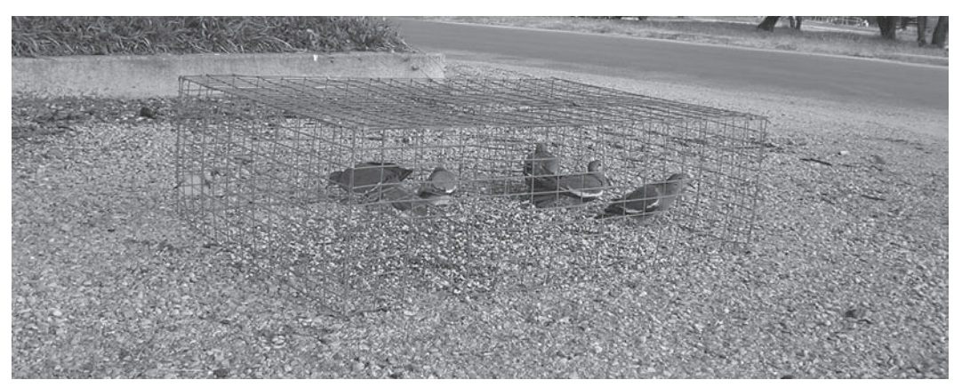
Figure 1. White-winged Doves in a walk-in trap.